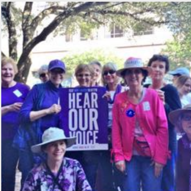
AAUW San Antonio members marching in Austin

Are you Facebook friends with your representative? This is an easy way to make your voice heard and is another way to have direct contact with government officials.