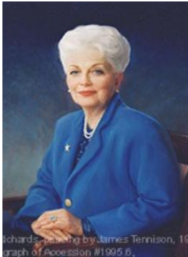
Governor Ann Willis Richards