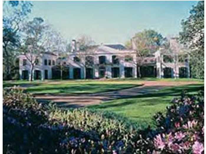
Spring 2000