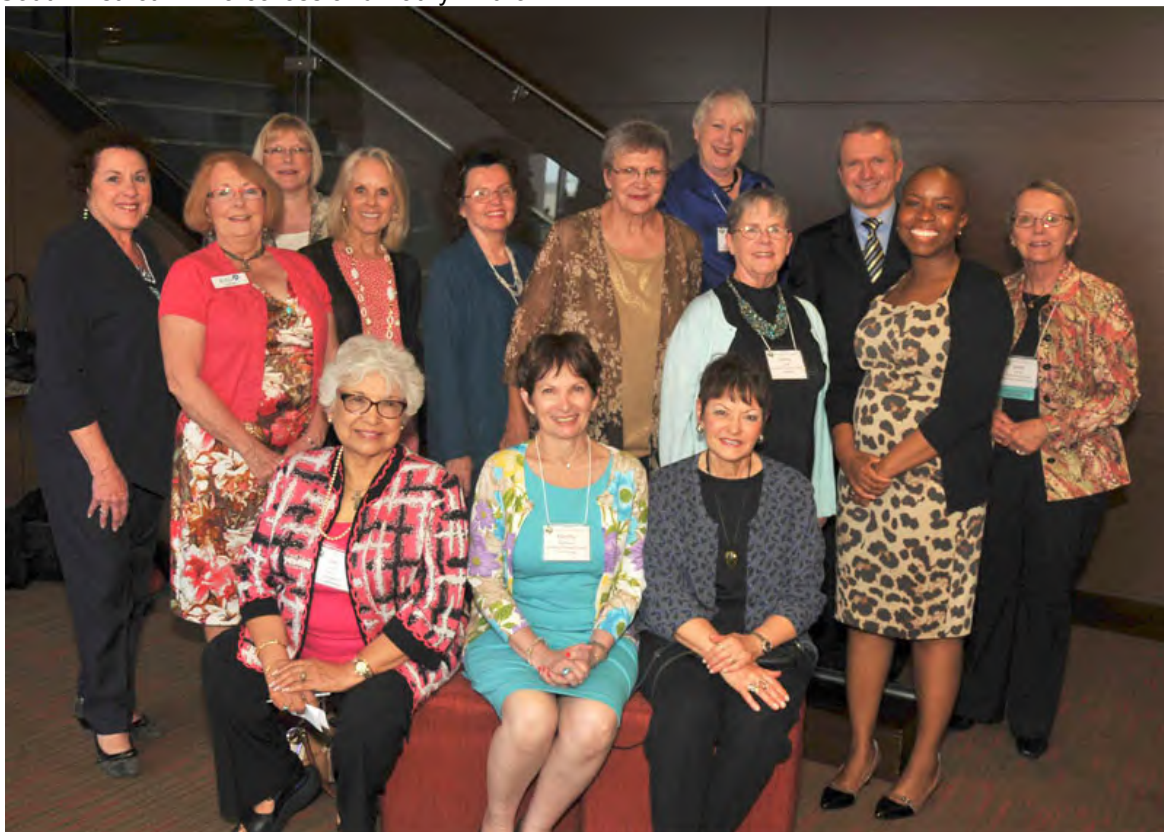
AAUW TX 2014-2016 State Board with folks from National.