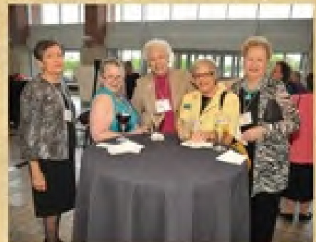
Friends from Branches across Texas Reunite during the Saturday Evening Reception