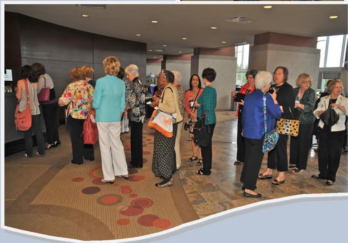
The Bar Line Saturday Night