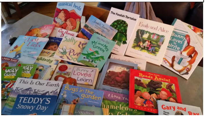
Above - books for Vickery Meadow; Below - filled shoeboxes for the homeless

Our December auction and donations raised approx. $700 for LAF and scholarships. We also collected a stack of books for Vickery Meadow children and a stack of shoeboxes with gloves, toothbrushes, and other goodies for the Stewpot to give to the homeless. Photos of the donations are below. Thanks to our members for their generous donations and for supporting AAUW Dallas activities!